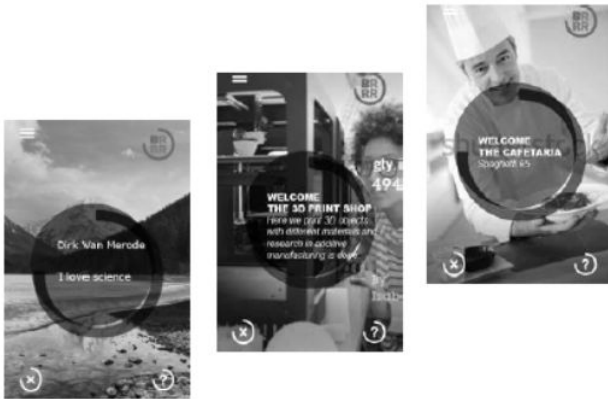
Fig. 3. Application interface

Smart Campus is a mobile application which provides users a variety of functionality, allowing working both in on-line mode as in off-line mode detecting buzz from the beacons (Fig. 3).